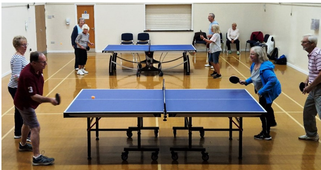
Wednesday Group playing on our new table (in the foreground)

The table purchased was not the first choice of the groups but is proving to be a most welcome improvement in the facilities. All four groups continue to meet regularly on Mondays, morning and afternoon and Wednesday, and Friday afternoons.