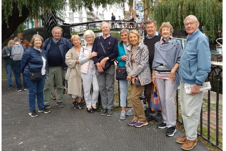
Group members beside Regent's Canal

Any enquiries about joining the Explore London groups are forwarded to the Groups' Support team.